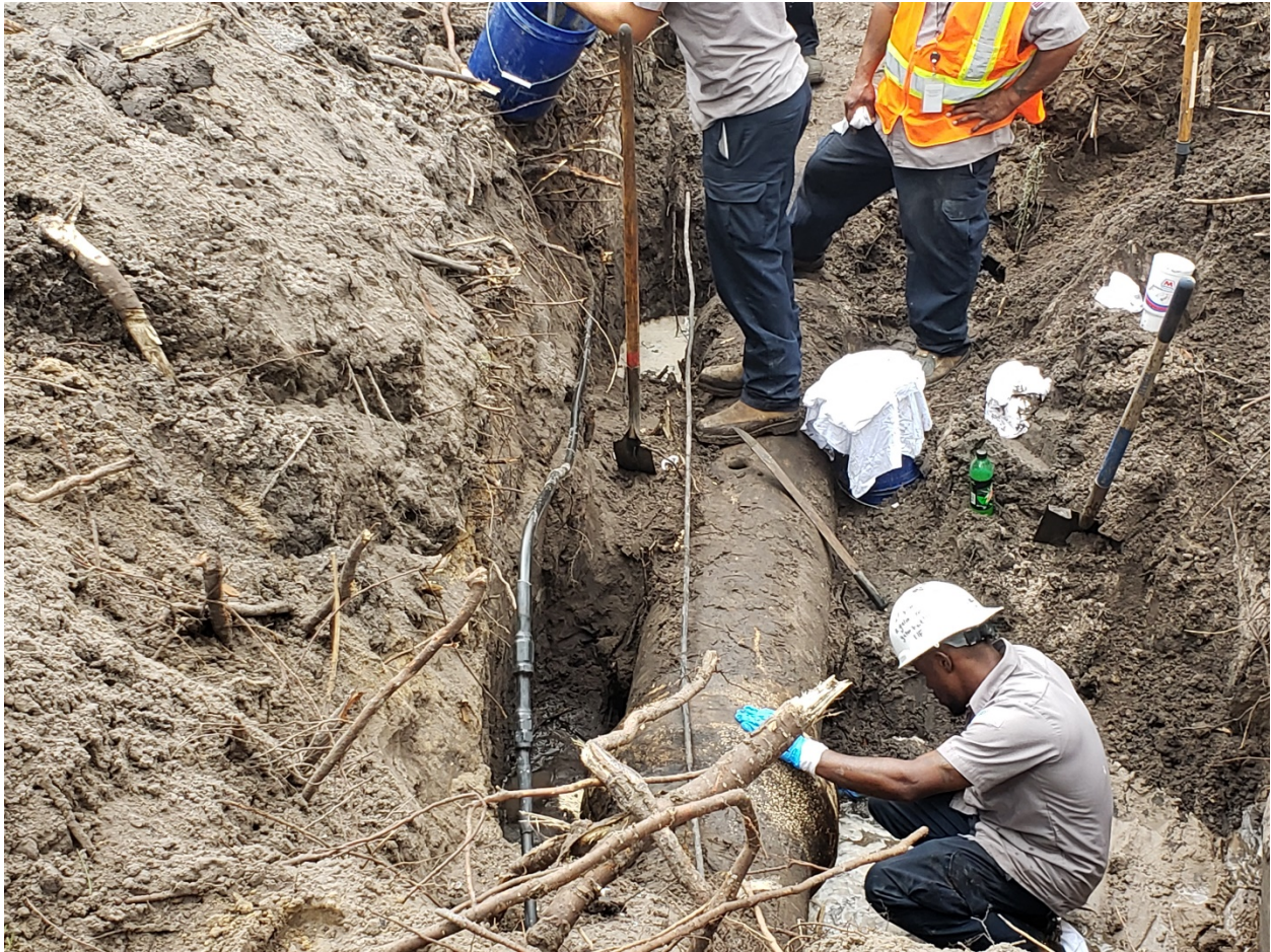
Storm sewer impacted by roots

The storm sewer providing drainage for the NW 52 nd Terrace became completely clogged with tree roots. Crews worked to remove the root ball from the concrete pipe and flush accumulated debris from the pipe.