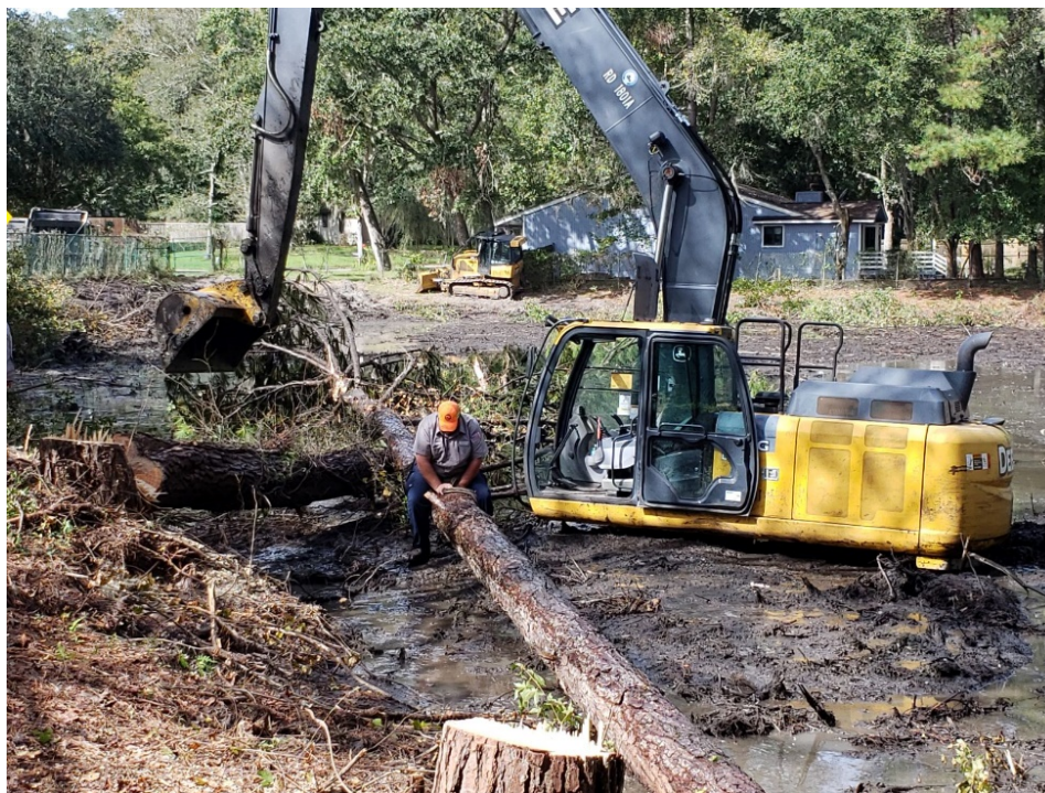
Access clearing and muck removal