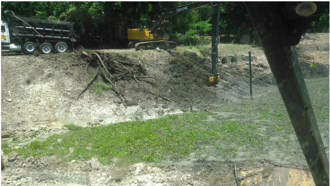
Dredging Robin Lane basin bottom