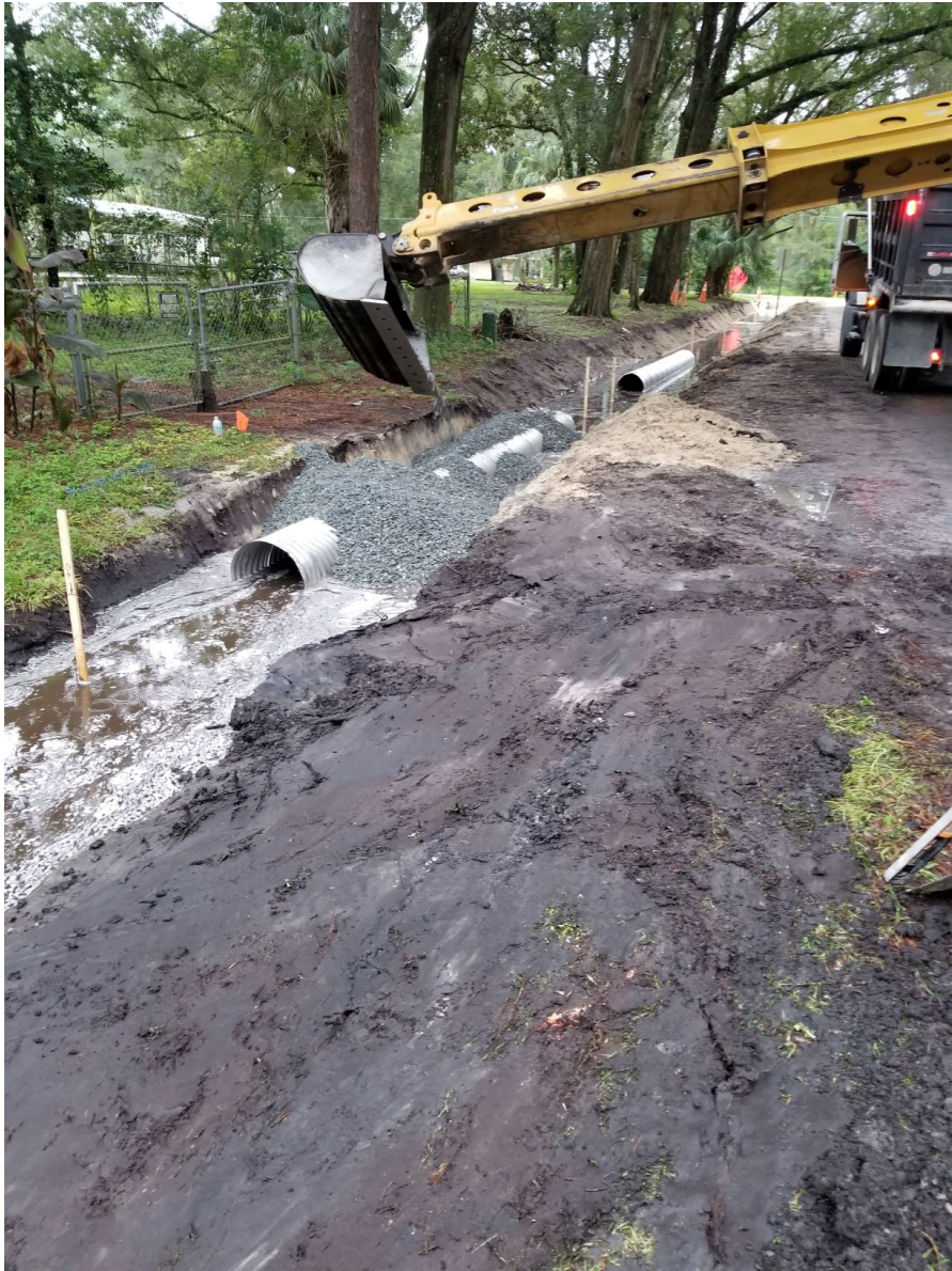
Ditch grading and driveway culvert repair

Heavy rainfall and wet season water tables caused roadway and yard flooding Along NE 76 th Avenue and NE 52 nd Terrace. Improvements to the roadside ditches provided relieve to residents who were having issues accessing their property.