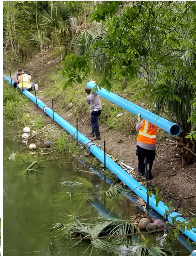
Assembling permanent piping