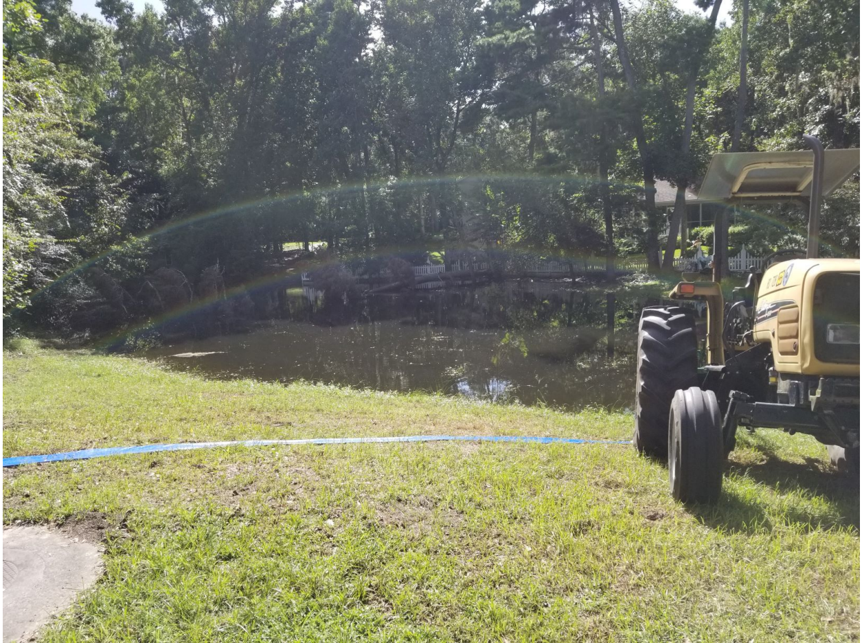
Basin pumping with PTO powered "Gator" pump

This work was done to draw down the water level of a basin that had filled up and remained outside of its boundaries. Public Works is planning to improve the soils in the bottom of the basin to provide faster infiltration of stormwater.