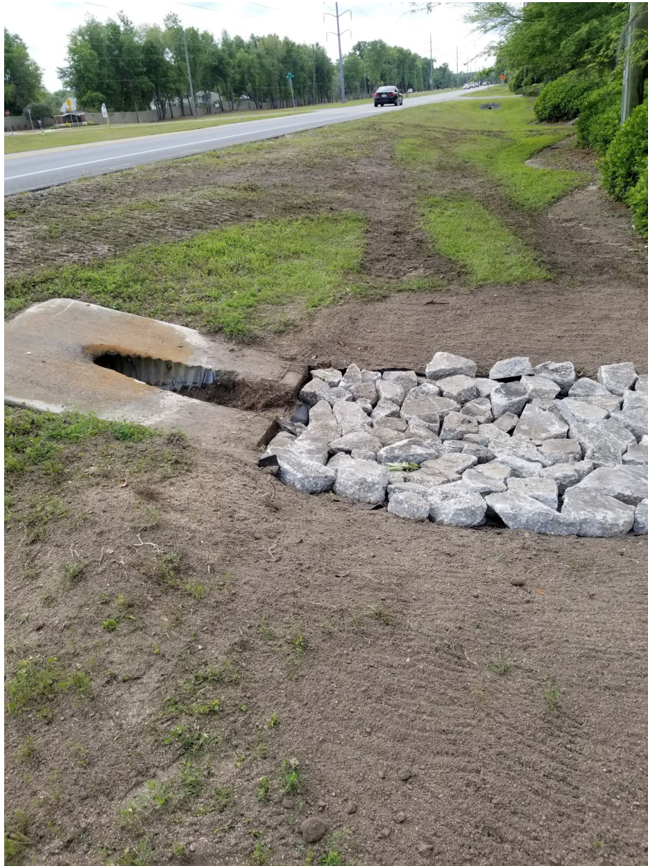
Cross-drain outfall stabilization

The flow out of this cross-drain caused erosion within the right-of-way and on the side slope of an adjacent receiving basin. Due to the severity of the erosion, rip-rap was utilized to stabilize the area rather than seeding/sodding.