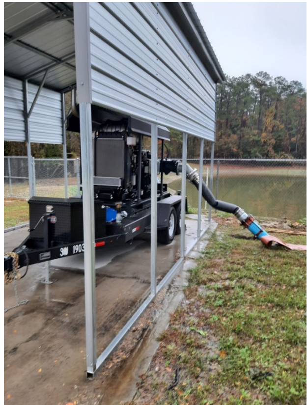
New pump primarily for Robin Lane

Public Works maintains the stormwater basin located near the intersection of NW 39 th Avenue and NW 75 th Street which serves the Robin Lane subdivision. The characteristics of this basin are similar to the “Red Lobster” basin, having no outfall and poor infiltration. This basin has flooded SW 75 th Street on several occasions as well as to nearby homes. Permanent piping was installed which connects to the drainage system for NW 39 th Avenue which is owned by FDOT. This connection allows pumping in preparation/response to major storm events. Prior to this work, County crews had to place discharge hose across the sidewalk and along the gutter on 39 th Ave to discharge into FDOT’s system in order to conduct pumping operations. This impacted pedestrians and motorists on NW 39 th Ave. The basin bottom was also dredged to improve infiltration.