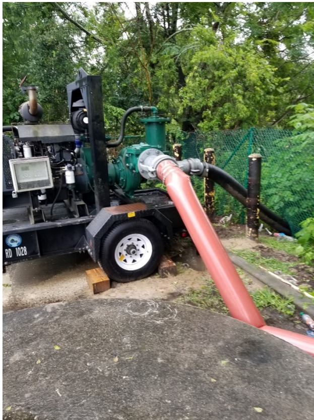
Portable pump connected to permanent piping with high pressure hose

Public Works maintains the water levels in the stormwater basin along NW 69 th Terrace just north of Newberry Road across from the Red Lobster restaurant. This basin serves NW 69 th Terrace and several other County-maintained roadways. This wet detention basin has no outfall and has poor infiltration. The water level is maintained by pumping. Before and after major storm events pumping is done to prevent/relieve roadway and property flooding in this area. The PVC piping replaces hose that has been used historically which often suffered from leaks and pressure limitations. The new piping will reduce staff time associated with routine operations as well as flood response.