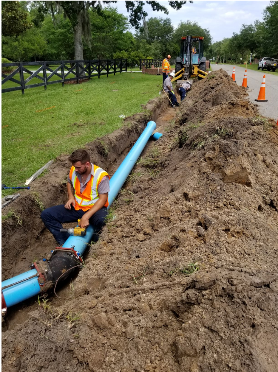
Permanent piping installation

Crews installed PVC piping from a flood plain in Hayes Glen to a drainage easement in the adjacent Cheney Walk Estates subdivision. This location has a history of roadway and property flooding. The permanent piping will allow us to rapidly deploy pumps after flood events, as well as focus manpower on other recovery efforts.