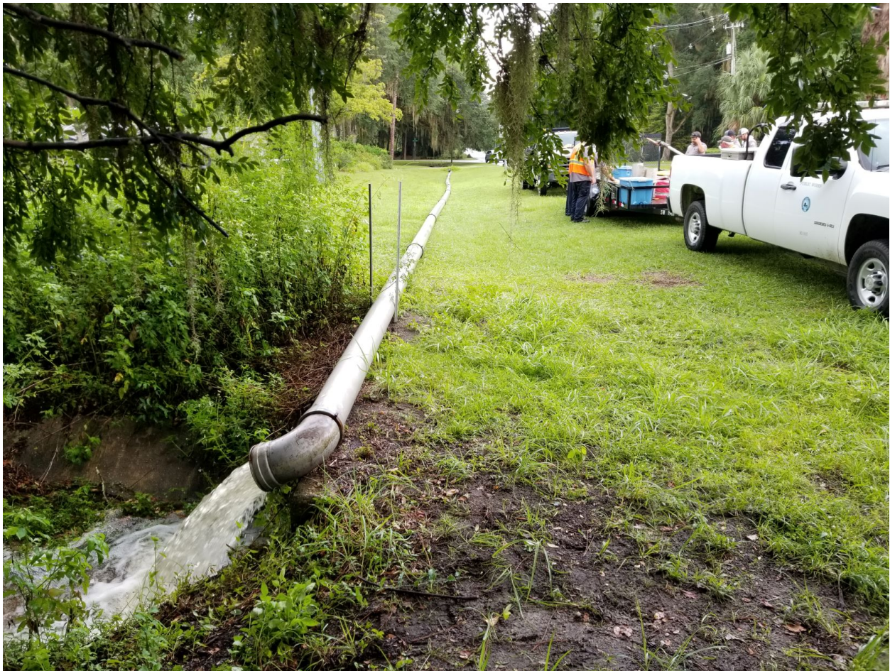
Above ground piping used previously

Permanent piping was installed underground to improve the maintenance and emergency operations that have been conducted at the basin located along SW 1 st Place at SW 80 th Drive. The wet detention basin has no outfall and has required pumping for both maintenance and emergency purposes. The installation of the permanent piping allows these operations to be conducted much more quickly and efficiently than was previously possible utilizing hoses/pipes that had to be set up and removed for each instance.