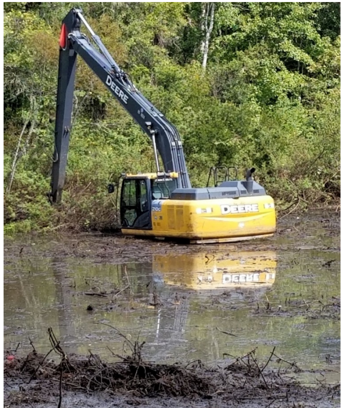
Overgrowth and muck removal

Crews are restoring a stormwater basin that serves the roadways in the northern portion of Deer Run. This is a wet detention pond that became overgrown with vegetation and full of muck. The basin's water quality treatment volume was greatly diminished by the volume of vegetation and muck. This basin discharges to Blues Creek. Operations were conducted to prevent water quality impacts to Blues Creek. Residents were reporting this area as an eyesore and appeared to welcome the work.