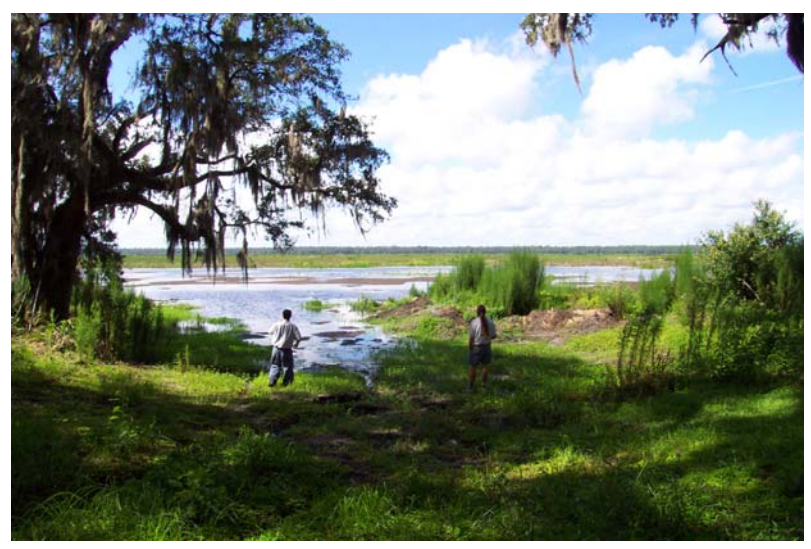
The Land Conservation Board on tour of the project.