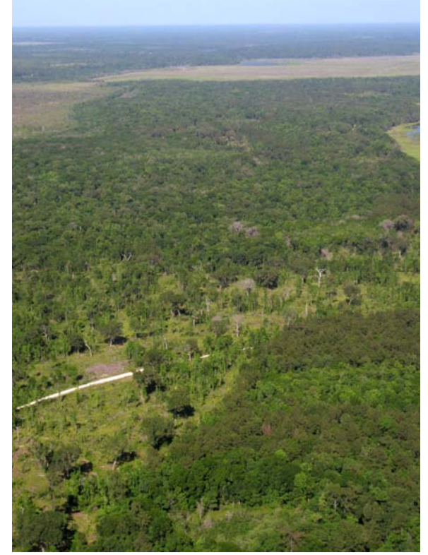
Barr Hammock.