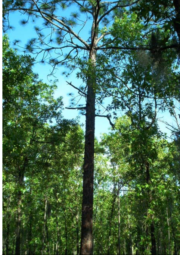
One of the site's namesake Longleaf Pines