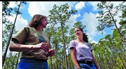
County staff evaluating the property