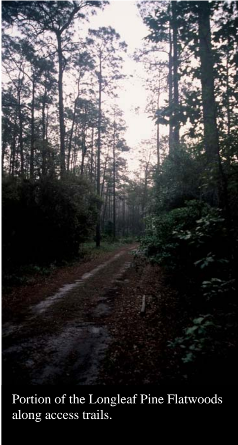
Portion of the Longleaf Pine Flatwoods along access trails.