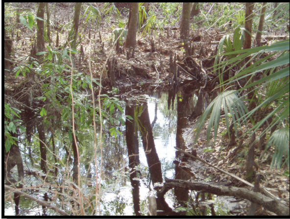
Unnamed creek flowing through tract to Newnan's Lake