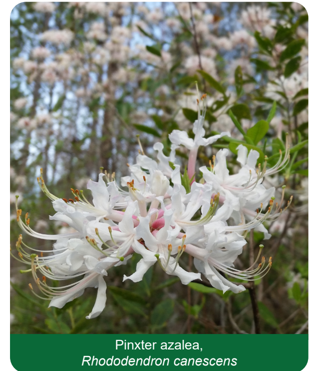
Pinxter azalea, Rhododendron canescens