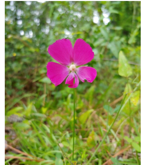
Woodland poppymallow, Callirhoe papaver